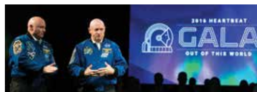
Cover photo: NASA astronauts and identical twins, retired Navy Captains Mark and Scott Kelly (and the only twins ever to go into space), launching the Minneapolis Heart Institute Foundation® Valve Science Center at the 2016 Annual Heartbeat Gala.